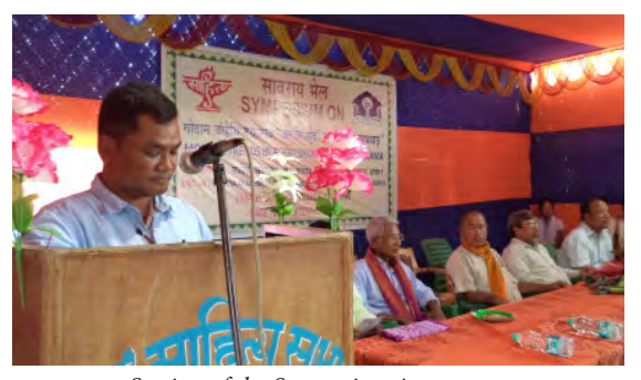
Session of the Symposium in progress

In collaboration with Karbi Anlong District Bodo Sahitya Sabha, a Symposium on "Modern Trends in Bodo Short Story and Drama" was