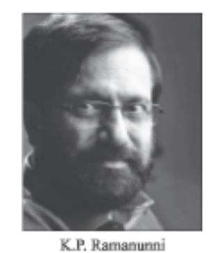
Annual Report 2017-18