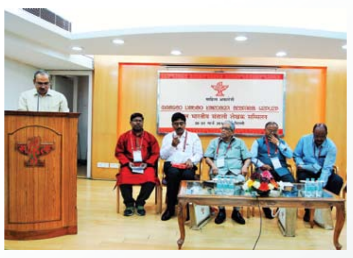
The Inaugural Session of the Meet in progress

ALL INDIA SANTALI WRITERS' MEET March 30-31, 2017, New Delhi