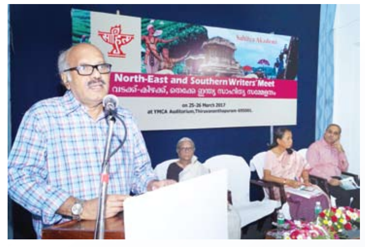
Inaugural Session of North-Eastern and Southern Writers' Meet in progress