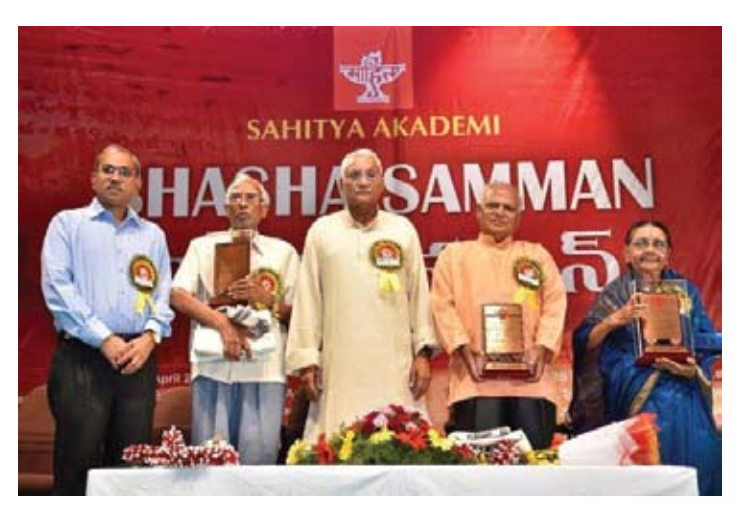
Recipients of Bhasha Samman with the President and Secretary of Sahitya Akademi