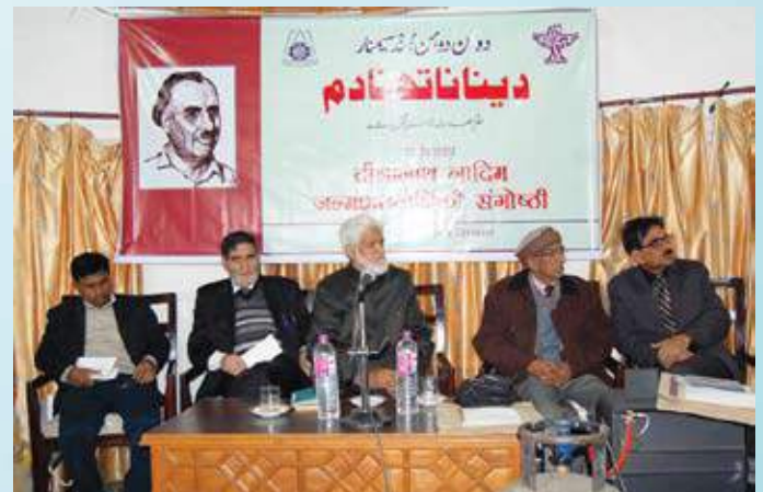
Inaugural Session of the Seminar in progress