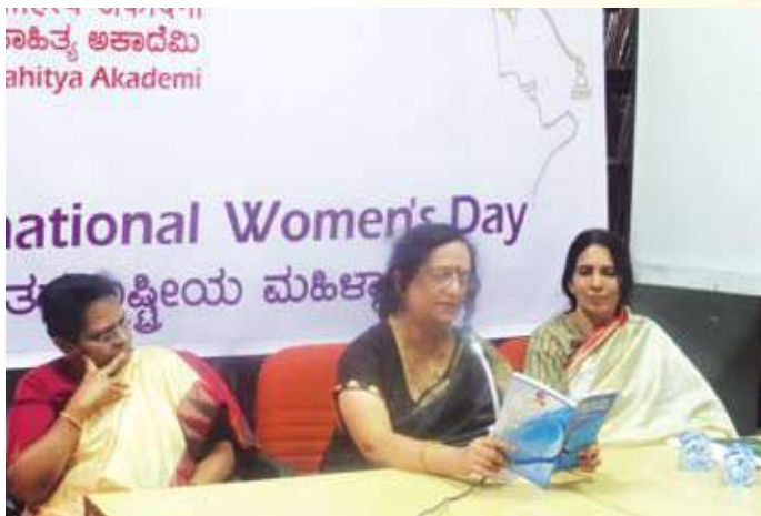
Participants of Nari Chetna at Bengaluru