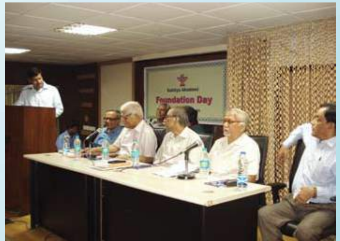
Foundation Day celebrations at Kolkata office in progress