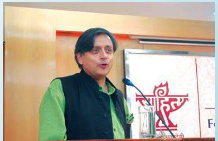
Dr Shashi Tharoor delivering Foundation Day Lecture