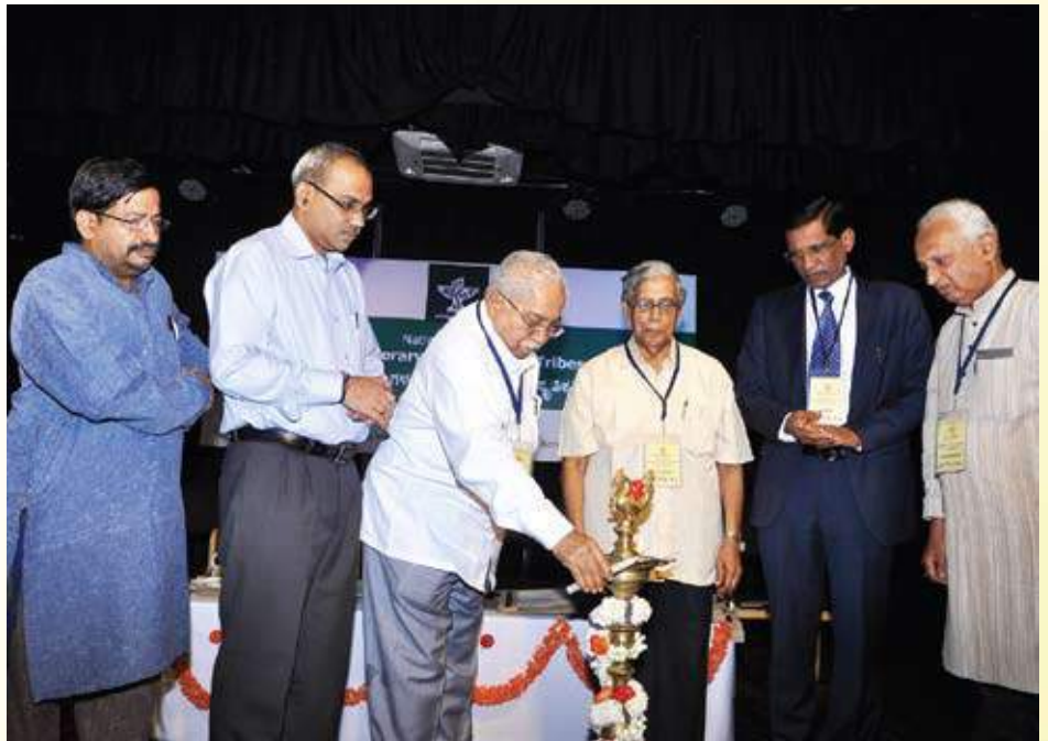
Dr Chandrasekhara Kambar lighting the lamp and inaugurating the seminar