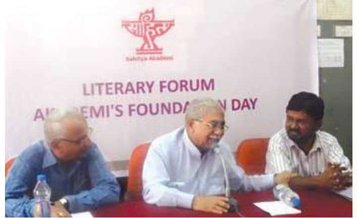
Dr Chandrashekhara Kambar speaking on the occasion of Foundation Day