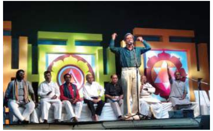
Poets' Meet at Simhastha Kumbh in progress