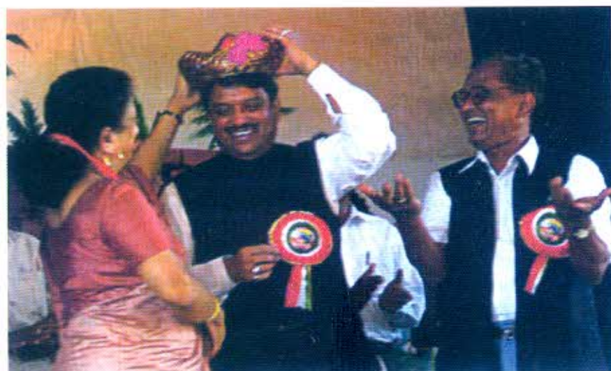
Honouring Chief Minister, Maharashtra, at 87th Akhil Bharatiya Marathi Natya Sammelan