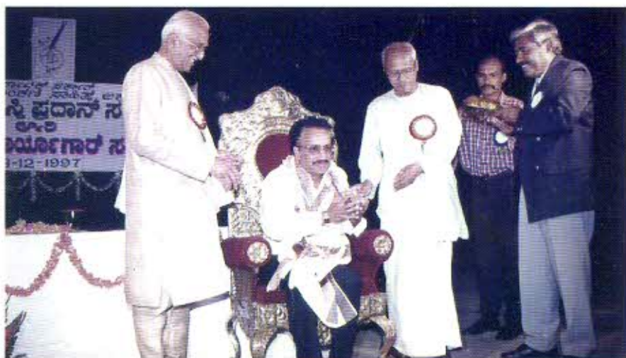
Receiving Karnataka Konkani Sahitya Academy Award

For about four months he was without a job and even under such stressful mental conditions and disappointments he could hone his writing talents. Finally, he got a very low paying job as a typist in a company dealing with petroleum refineries. He put his miniscule knowledge of two years of engineering and spent hours learning to know and understand thousands of technical material used in the oil sector. He became an expert in International Tendering, a formidable salesman and in short, he had really landed. More so, when the newly revamped Kuwait National Petroleum Co. KSC, Mena Abdullah Refinery, Kuwait, picked him up and gave him the break of his life – he was hired as a Materials Coordinator of