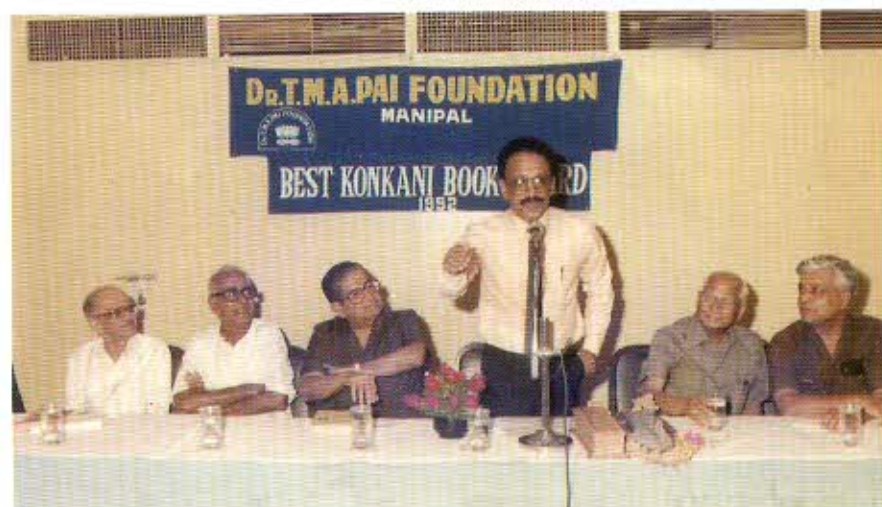
Receiving T. M. A. Pai Foundation Award for Vinchun Kadleli Porza