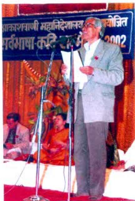
Reading poetry at Manipur Hindi Parishad, Imphal, Manipur

People's Choice–Lifetime Contribution to Literature from North East TV Guwahati in 2006.