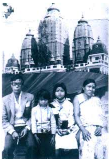
With his wife and daughter at the Birla Mandir in Delhi

Centre of Postgraduate Studies of Jawaharlal Nehru University, Imphal. He retired as Professor of Manipuri Language and Literature from Manipur University in 2003.