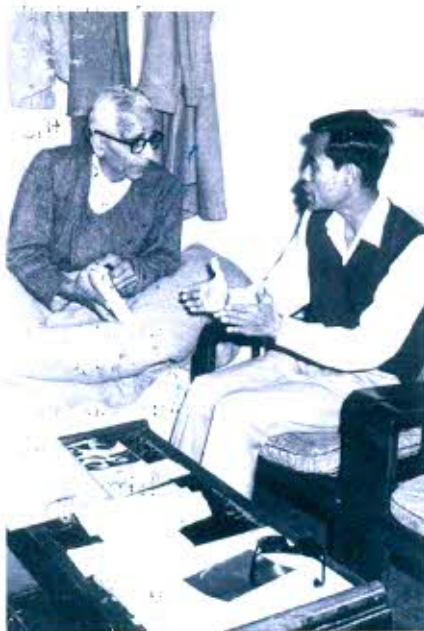
With Jainendrakumar (writer of Tyag Patra ) in New Delhi in 1970

After serving in Government higher secondary schools and colleges, Dinamani joined the