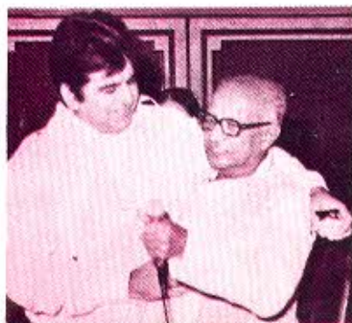
with Dilip Kumar.