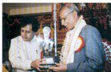
Receiving 'Sandesha' Award - 2001