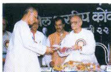
With Gulzar, releasing book - 2001