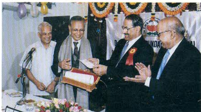
Receiving TMA Pai Foundation Award - 2001