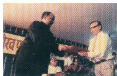
Receiving Maharashtra Gaurav Puraskar -1990