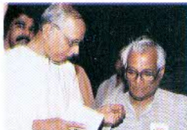
With George Fernandes

Currently, he is a member of the General Council and Konkani Advisory Board of the Sahitya Akademi. He is also Convener of the Konkani Advisory Committee of the Bharatiya Jnanpith.