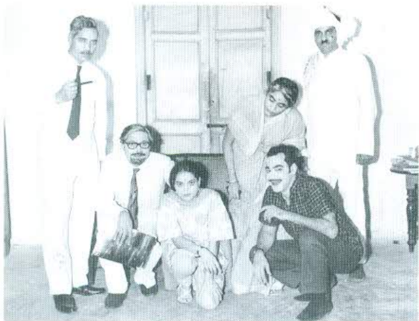
Acting (in beard) in one of his plays, 1971

poetry is very close to the colloquial speech.’ ( Kavya Bharati , 1997).