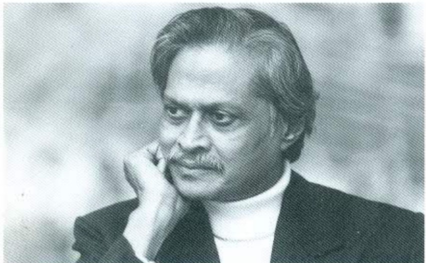
New Delhi, 2001