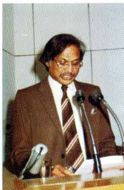
In a Sahitya Akademi Seminar, 1994

Closely associated with cinema, he has been on the Boards of the Children's Film Society (1985–1990) and the Orissa Film