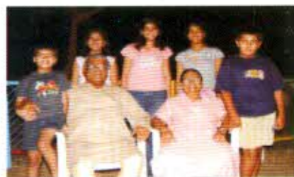
With his wife and grandchildren

"The train is leaving platform and its speed is accelerating. I have failed to board this train and am running fast and faster to catch the running train. AS I CONTINUE TO RUN ALONG THE MOVING TRAIN, PLATFORM GOES ON STRETCHING."