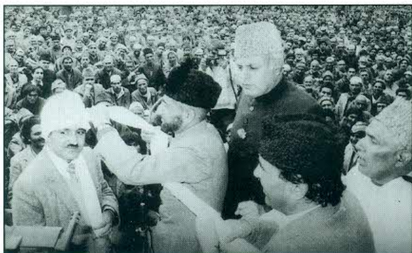
Being honoured at the Dargah Hazratbal for his literary accomplishments; also present, Dr. Farooq Abdullah, Chief Minister, Jammu & Kashmir