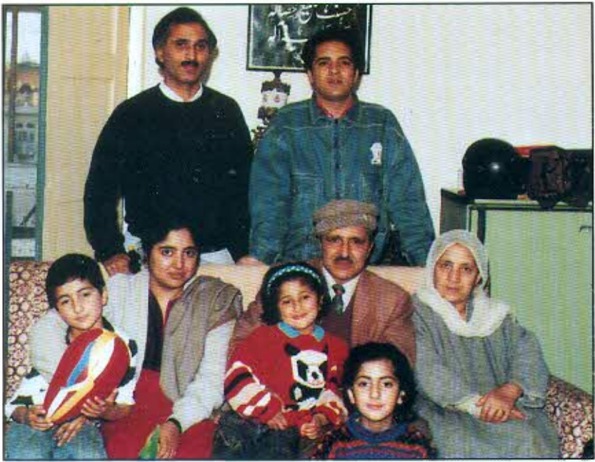
With his family