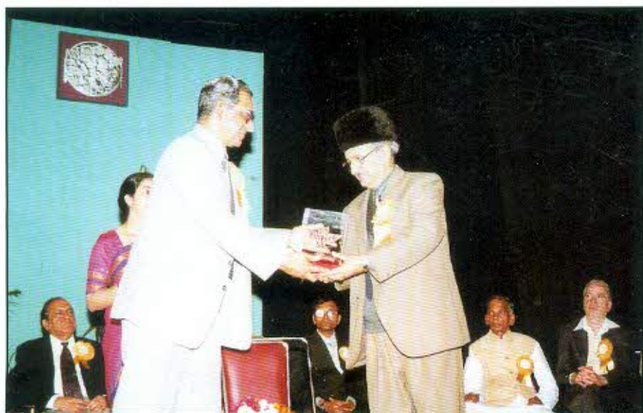
Receiving Sahitya Akademi Award from Shri Ramakanta Rath. Also present, Prof. G.C. Narang