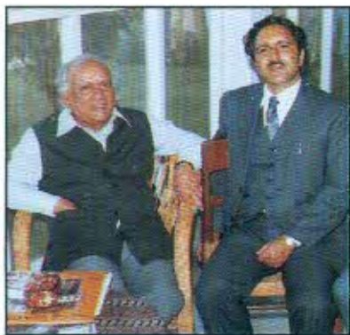
With Faiz Ahmad Faiz

took over as the editor of the Urdu bi-monthly Shiraza , an organ of the Jammu and Kashmir Academy of Art, Culture and Languages, in 1962. Thus began his long association with this organisation, which he came to head in 1973. He continued to head this important body till 1993. The Academy, during his tenure, rendered yeoman's service for the promotion of languages and literatures of the state as well as the encouragement of research in all of them.