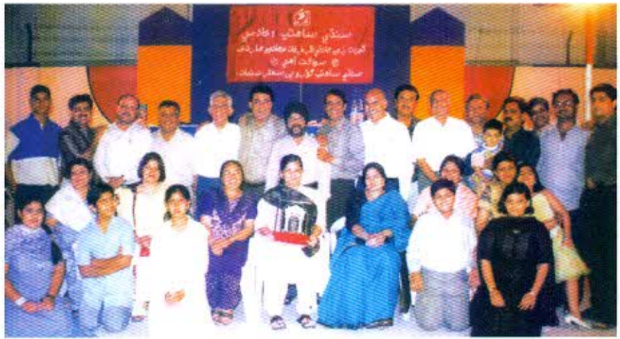
with artists of Sindhi Drama Workshop, Ahmedabad.

poems beyond the contemporary period preserves the essence of the poems, and it's not a mean achievement in creative field.