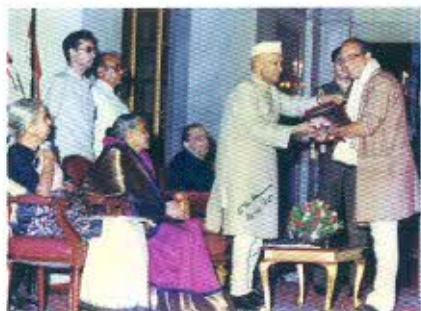
Receiving Sangeet Natak Akademi Award