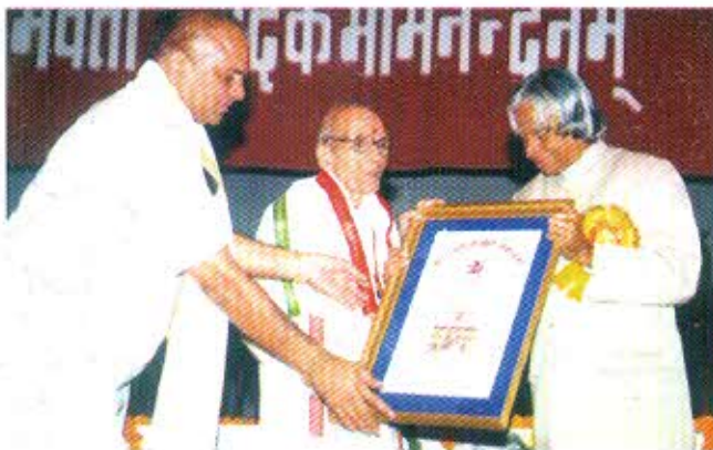
Receiving International Himadri Sanskrit Sammana of Uttaranchal Sanskrit Academy from H.E. Dr. A.P.J. Abdul Kalam, President of India, 2004