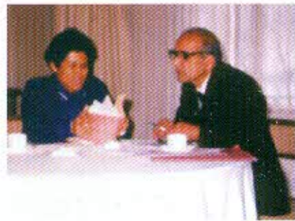
Giving lessons in Sanskrit to Her Royal Highness the Princess of Thailand