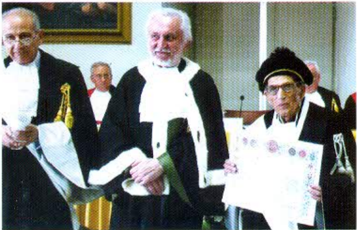
Receiving Honorary Doctorate from the University of Torino, Italy, 2012