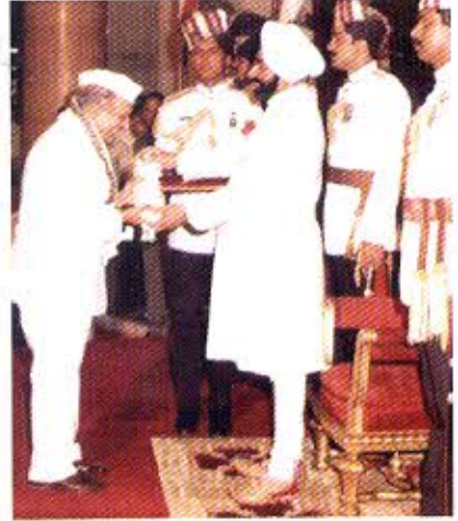
Receiving the President of India Certificate of Honour from H.E. Shri Zail Singh, President of India, 1985