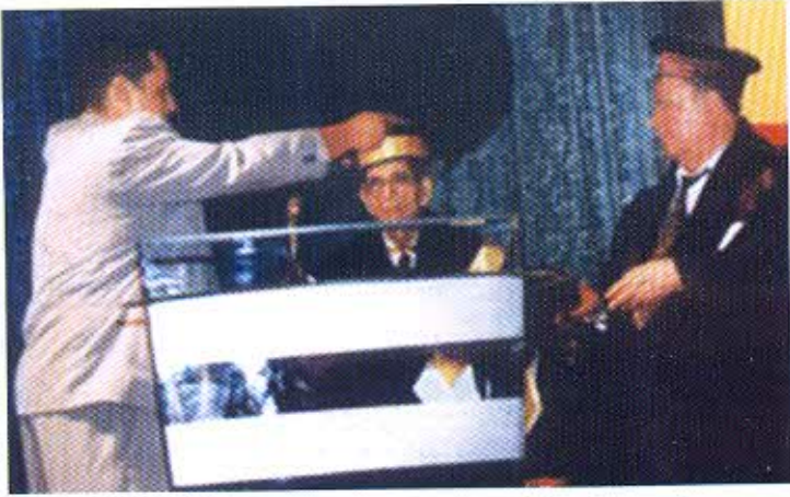
Receiving Doctorate Honoris Causa from University of Oradea, Oradea, Romania, 2001