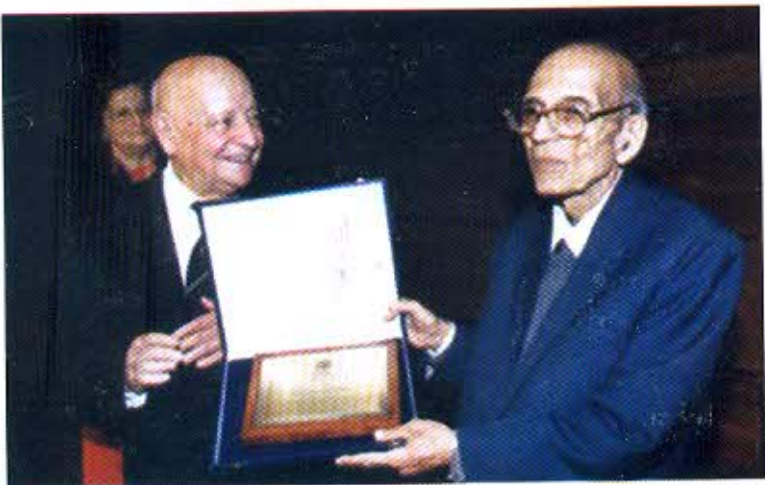
Receiving Golden Prize from the CESMEO, the International Institute for Advanced Asian Studies, Torino, Italy, 2001