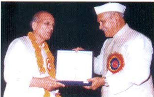
Receiving Viśiṣṭa Sāhitya Award of Uttar Pradesh Sanskrit Academy, Lucknow from H.E. Dr. Shankar Dayal Sharma, Vice President of India in 1988