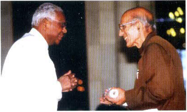
Receiving Padma Shri from H.E. Shri K.R. Narayanan, President of India, 1999