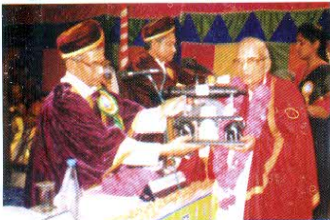
Receiving the Mahamahopadhyaya degree Honoris Causa from the Rashtriya Sanskrit Vidyapeetha, Tirupati, 1999