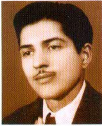
As a Young Graduate