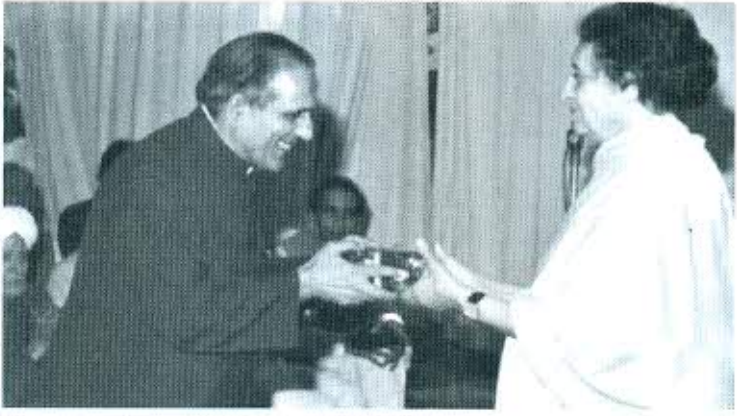
Presenting the copy of Indirāgāndhīcaritam to Prime Minister Indira Gandhi