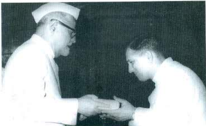
Receiving Sahitya Akademi Award in Sanskrit from H.E. Dr. Zakir Hussain, President of India, 1968

Awards and honours rushed to him in legion. He is recipient of seventy nine Awards, both national and international, including the prestigious Padmabhūṣaṇa. He is the only Sanskrit scholar to have been honoured with the prestigious Jñānapiṭha Award. Italy has showered on him some of the rarest honours that it has in its repertory, while the University of Torino, in a rare gesture, conferred on him Honorary Doctorate on May 3, 2012. The Academy of Mediterranean Studies, Agrigento elected him its Fellow for life.