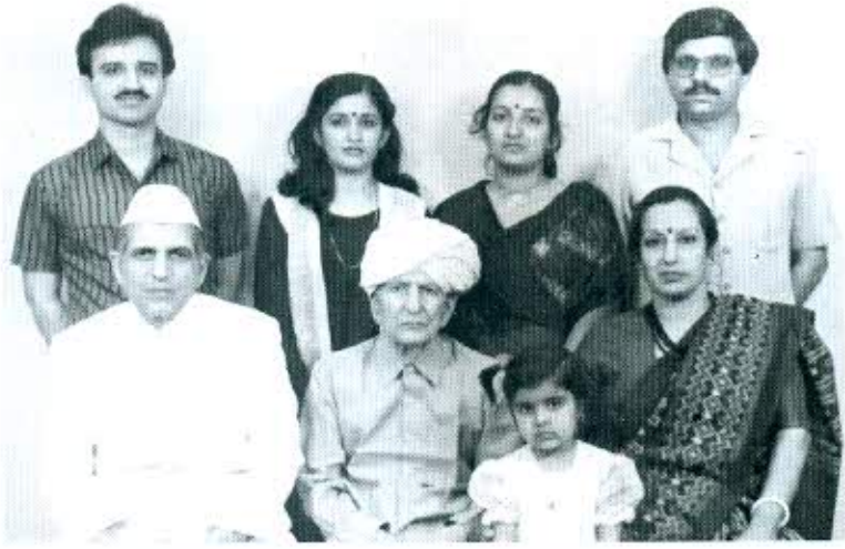
With his father (Centre) and other family members

The same freshness breathes through the execution of his poems. It bears the imprint of a sober mind, well attuned to the imperatives of elegant poetry. The way he has imparted cohesion to the motley data in his comprehensive poems speaks volumes of his skill in handling the burly themes with vision and precision.