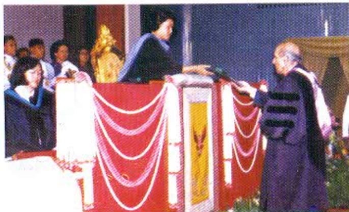
Receiving Doctorate Honoris Causa from the Silpakorn University, Bangkok presented by Thai Princess H.R.H. Maha Chakri Sirindhorn, 1993