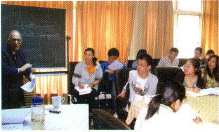
Teaching a class at the Peking University, 2011