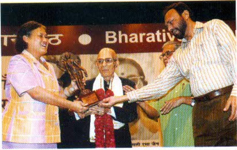
Receiving Jnanpith Award from H.R.H. Princess Maha Chakri Sirindhorn of Thailand, the Guest-of-Honour at Jnanpith Award Ceremony, 2009