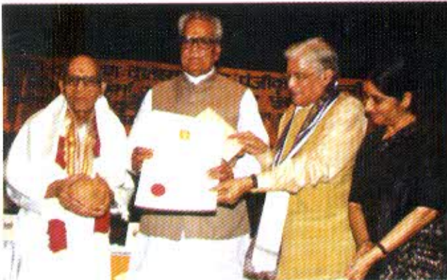
Receiving Chandrawati Joshi Sanskrit Bhasha Puraskara from H.E. Shri Bhairon Singh Shekhwat, Vice President of India, 2003