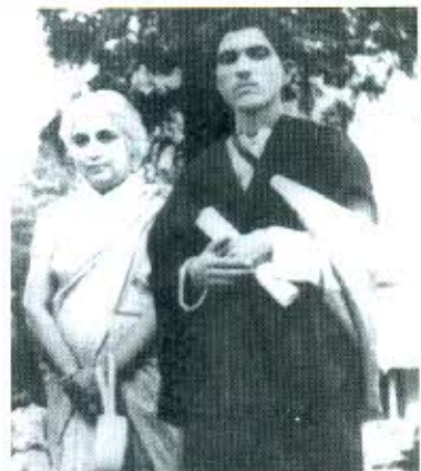
With Mrs. Vijayalakshmi Pandit on receiving record marks in B.A. (Hons.) Sanskrit

The corpus of versified letters, spread over two sizable volumes, tends to raise the trite practice of letter writing to literary heights. Intended to be mini-kāvya, they settle down as an independent branch of poetry. His contribution to the travelogue literature is solid and substantial. The Śarmṇyadeśaḥ sutarām vibhāti purports to be a perceptive account of the author's visit to the Federal Republic of Germany.