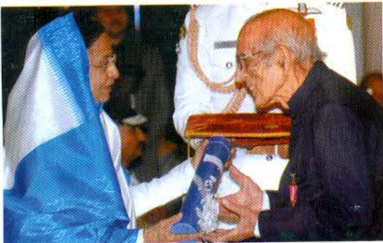
Receiving Padma Bhushan from H.E. Mrs. Pratibha Patil, President of India, 2010