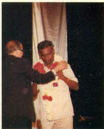
Being garlanded at the Sahitya Akademi Award function.

" If the art of writing turns into a business, no good writer will emerge in our society. Writing is not meant for entertainment only. It should have definite social objectives".