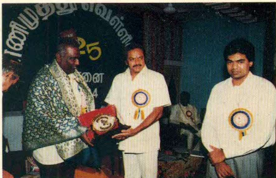
Receiving Aditanar Award

ultimate victory of a young woman who revolted against the injustice inflicted on her through a wedlock.