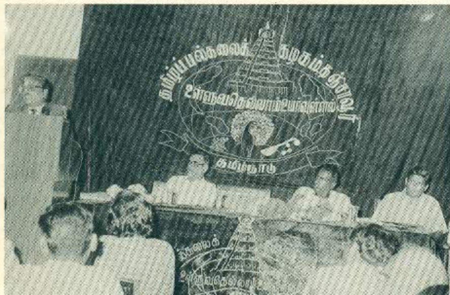
Receiving the Tamil Annai Award at Thanjavur.

Oru Kottukku Veliye, Manivasagar Pathippagam, 1977 - pp 200