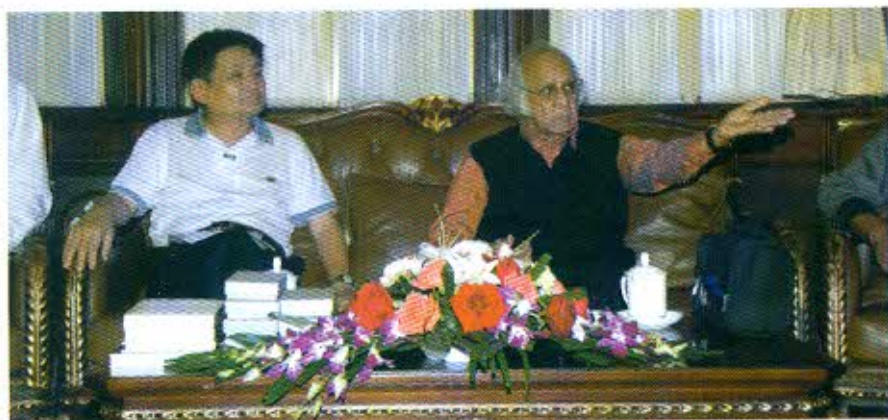
With a Chinese writer in Shanghai, China