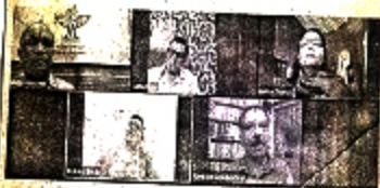
Refugee Message Thiruvu