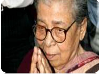
Mahasweta Devi (1926-2016)

One of the finest writers of modern India and social activist, Ms. Mahasweta Devi is no more with us. She was one intellectual whose heart beat, till the very end, for the welfare and upliftment of oppressed and downtrodden. Her writings were the voice of the voiceless, a beacon of light in the dark alleys of their hopeless lives. Master craftswoman, she portrayed the tales of hunger, suppression and moral dilemmas of the poor in a most vivid manner in her stories. From Jhansir Rani to Hajar Churashir Maa to Aranyer Adhikar (for which she won Sahitya Akademi Award) to Rudali and her other writings, it was a journey offering hope to the hopeless and we all should be thankful to her for taking us along.